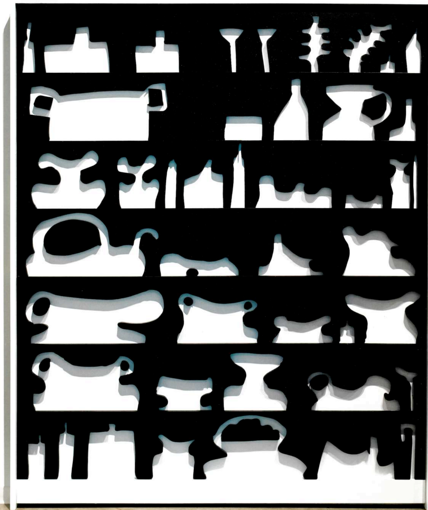
Inheritance , 2016, medium-density fiberboard, acrylic paint, and drywall, 72 x 46 inches.