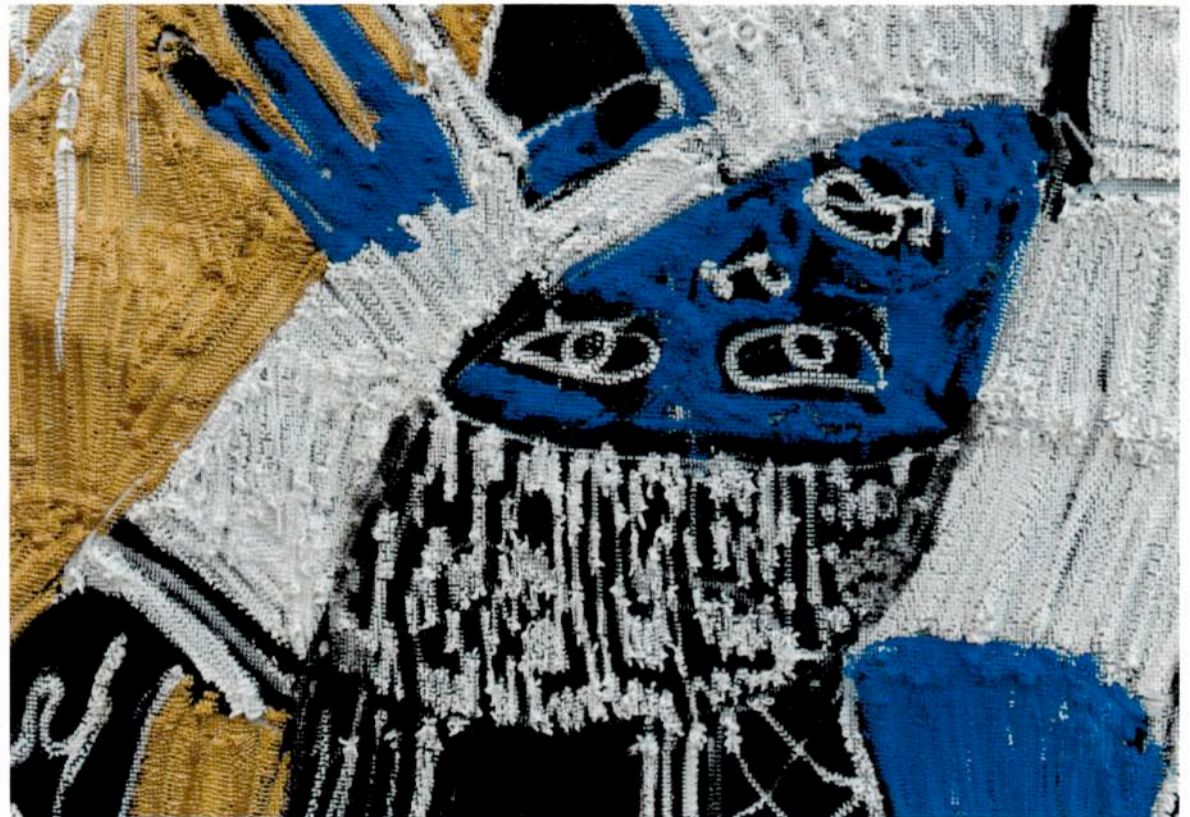
(i) Breadwinners , 2016, acrylic on aluminum mesh, 68 x 96 inches. (ii) Detail of Pound , 2017, acrylic on aluminum mesh, 70 x 48 inches.