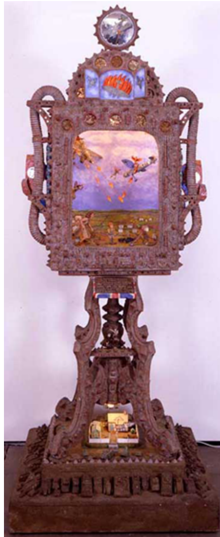
The Brandy Strafing. 1991. Mixed media, 28 x 28 x 73 inches.

out in the brandy by a German plane when I was 2 years old. The brandy was a cow pasture that doubled as a playground. My mother heard the siren and came running to get me. I don't remember the event of the strafing. I know unconsciously I must have seen the bombers. Whether I saw them in Edinburgh or in Shotts, it doesn't matter. For me it's an iconic image that reappears in my work.