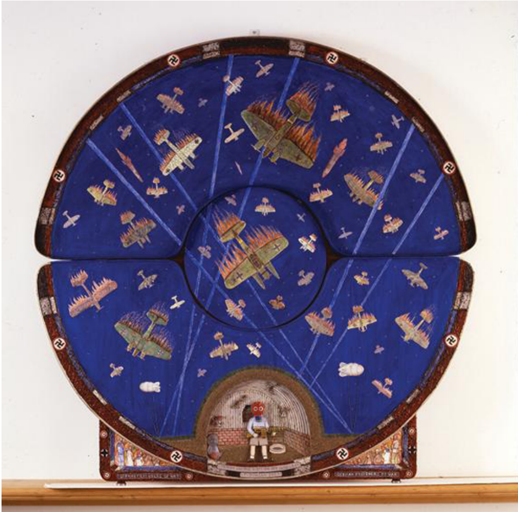
Tommy and the Scottish Sky. 2007. Mixed media, 47½ inches in diameter, 1½ inches deep.

physically make them, whether it's a sculpture or a wall hanging or a relief. [ He holds up a pad. ] This is sketch pad number 91. I write down every idea that I get. Sometimes I wake up in the middle of the night, and I'll have solved a problem. I'll get up and write it down. I just did a study for a piece I was thinking of doing, a burning tank series.