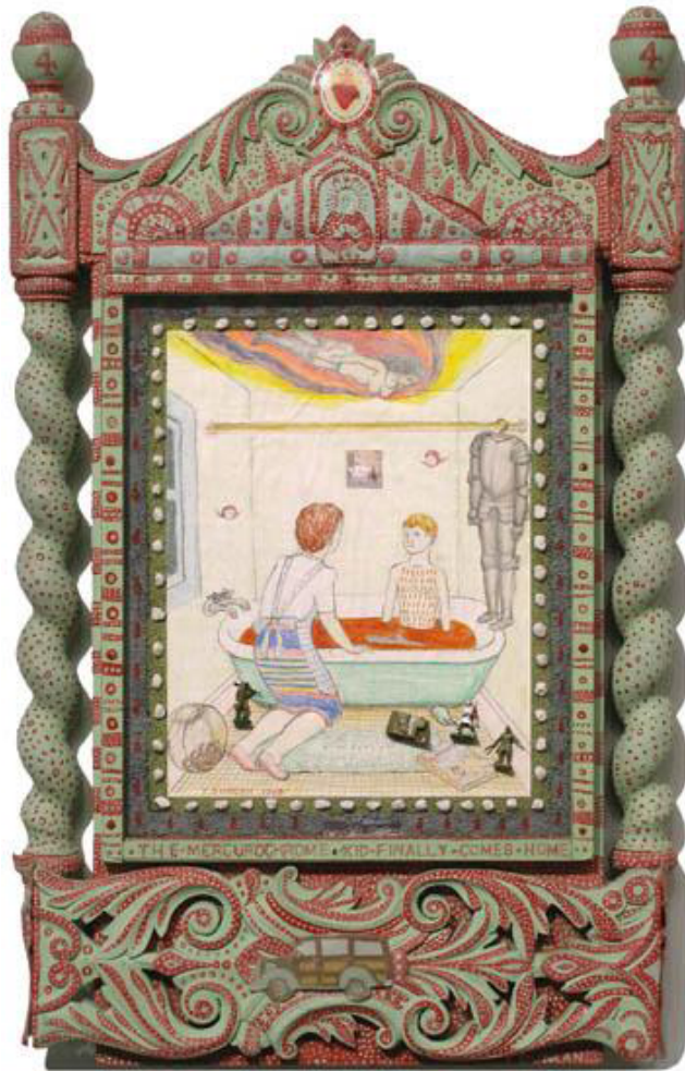
The Mercurochrome Kid Finally Comes Home. 1988. Mixed media, 16 x 25 x 2½ inches.

That was the last one of my first autobiographical series. In it, I'm telling my mother what happened. The frame for that piece had been a chair back. I like to transform something into something else.