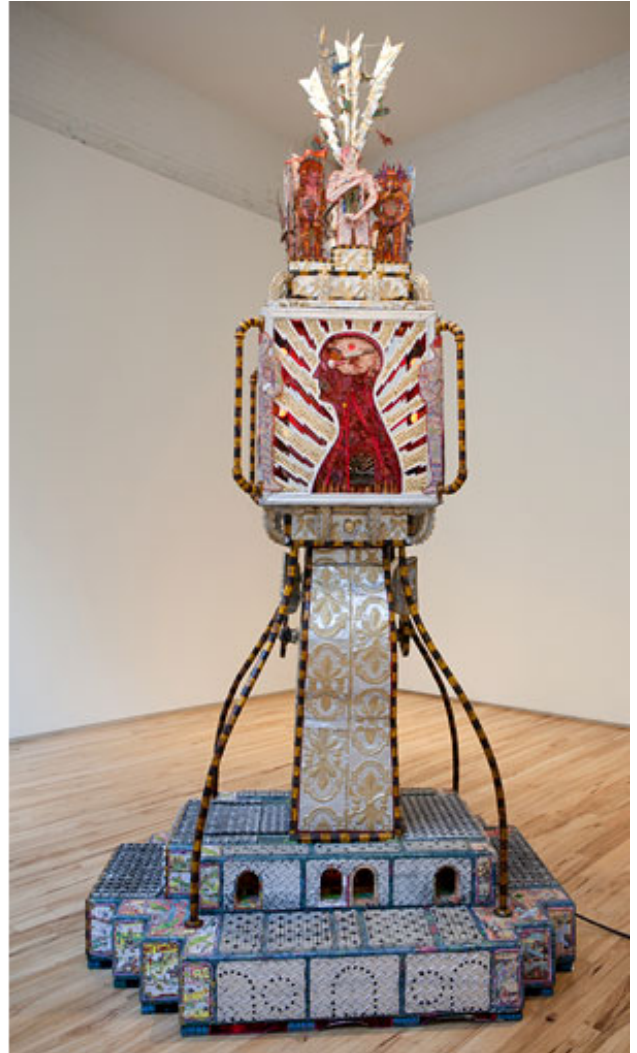
Portrait of Tom with a Migraine Headache. 2013. Mixed media, 10 feet 8¼ inches x 61½ inches x 46¼ inches. Left: front view. Right: right side view, headache side.