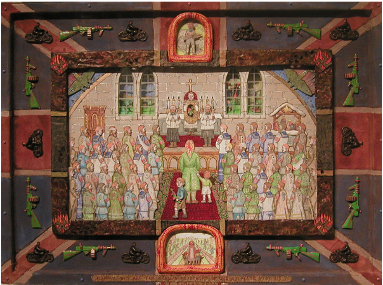
Mummy, Why Are the German Prisoners of War at Mass with Us? 2004. Mixed media, 36 x 27½ x 3½ inches.

I went to Scotland to see him when I was 40. He was a pretty nasty, violent alcoholic. And he had been very mean to my mother. He did some horrible things to her. Every day I woke up in this country wanting to kill him. At the age of 40, I thought, this is haunting me. I've got to go back and look him up and prove to myself that I wouldn't kill him. And that's exactly what I did. It was a very moving experience for both of us. I continued to write to him until he died a few years later. He was working as a guard in the prison down the road from where we lived, which during the war had been a prisoner-of-war camp for the German Luftwaffe.