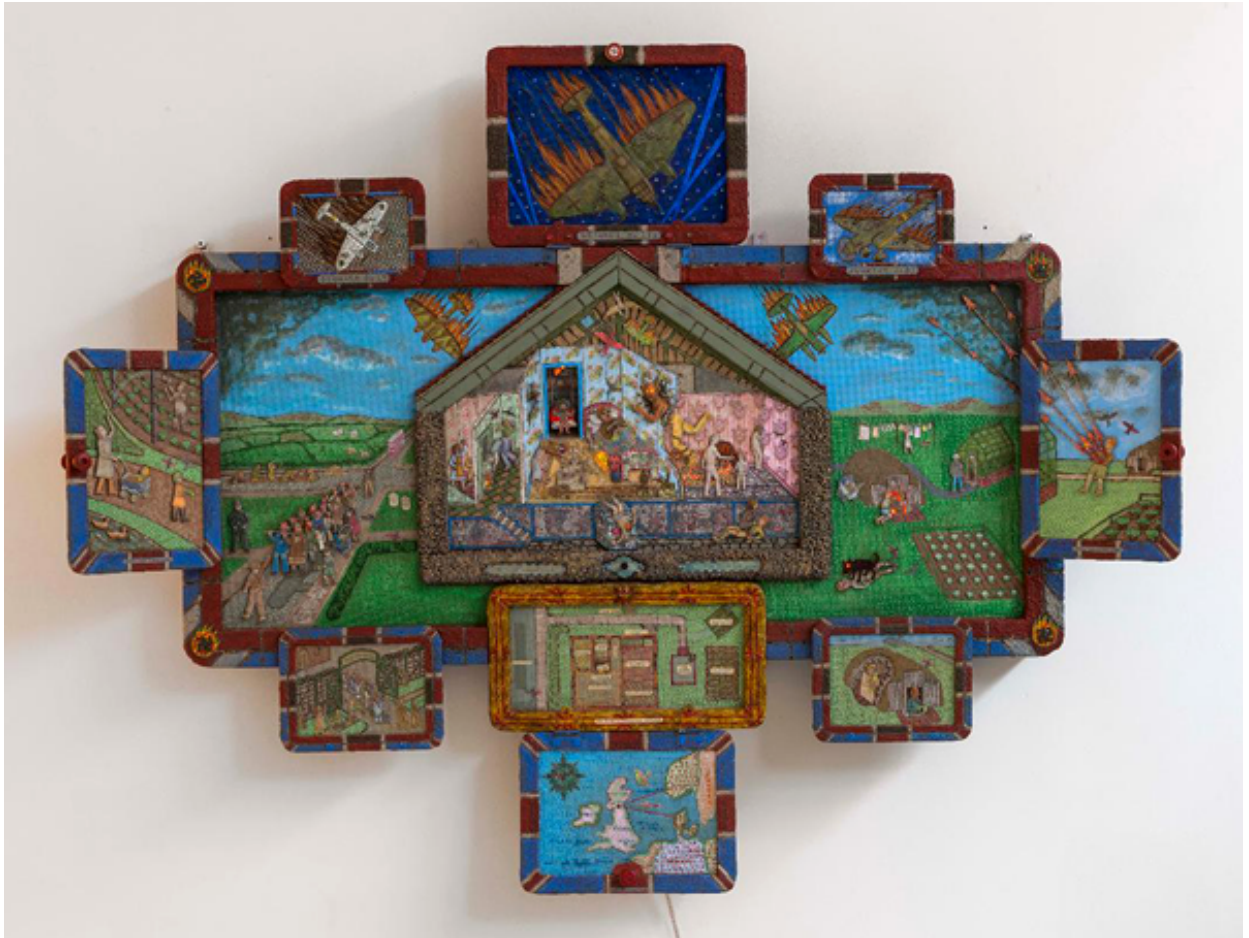
Inside—Outside. 2016. Mixed media, 61 x 46 x 4 inches.

I knew when I chose to be a sculptor that I was picking the most physical of the visual arts. I knew I wanted to do something physical with my body, and I also knew I wanted to do something with my mind. I love to think about things and create things in my head. Sculpture seemed to be the perfect fit for me. I felt fortunate that I was able to pick something that I knew I loved—and that I would sustain that love.