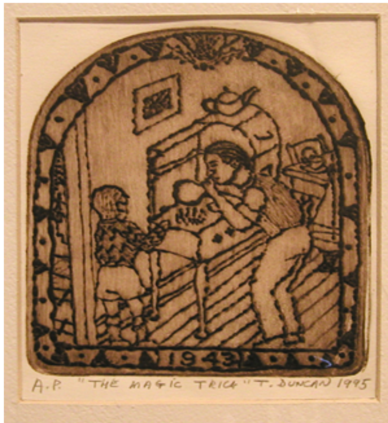
The Magic Trick . 1995. Hand-colored engraving, 4¾ x 5½ inches.

with a mast that could fold down; the sail would go down these little rings. I can still feel the texture of the hull of the boat. It was magic to see him make these things, and they were for me. He could take the handle of a baby carriage and turn it into the runner for a sled and make the sled out of wood. He would do all kinds of wonderful things. He was like a magician. One day he took a light bulb and said, Watch me. He cut off the filament of the light bulb, removed the filament, held the bulb over the kitchen stove and just gently blew up the light bulb.