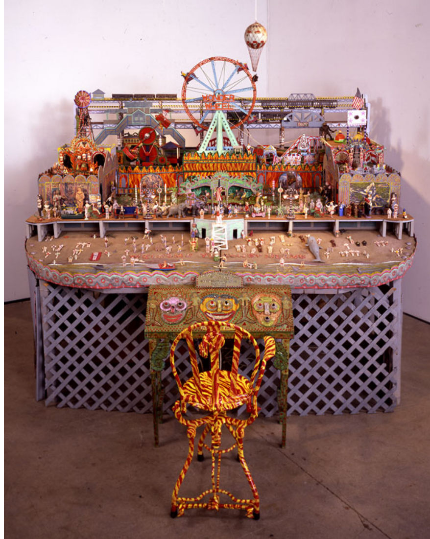
Dedicated to Coney Island. 1984-2009. Mixed media, 96 x 90 x 84 inches.

There are recognizable structures from Coney Island in the piece, like the Wonder Wheel.