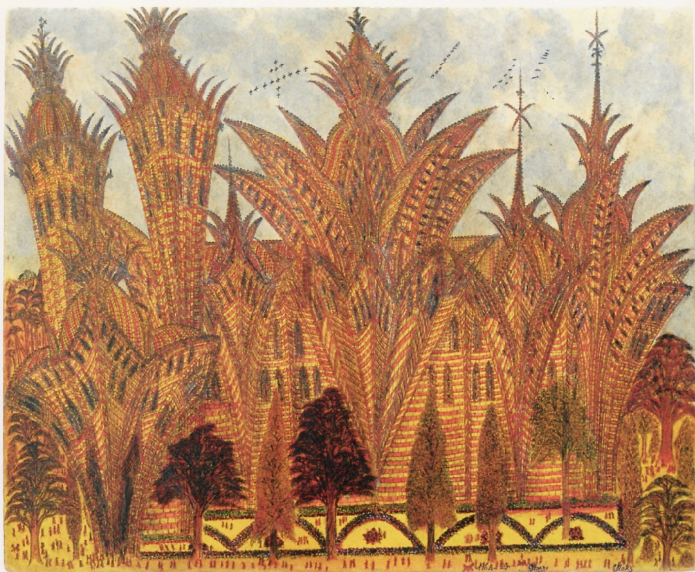
above Church , c.1964, 30 x 36.5cm, ink and pencil on paper, photo: J.P. Vidal private collection.

coloured, some only pencilled, others appear to have been worked over in inks, probably in the Sixties, with the introduction of crowds of people and trees in the foreground, a characteristic of his later style. During that early period, Storr's architectural imagination seems hampered by a tendency for imitation and realism, and above all by his slow, finicky technique, and he was also unable to refrain from piling up decorative or architectural elements, in keeping with the swiftness of imagination.