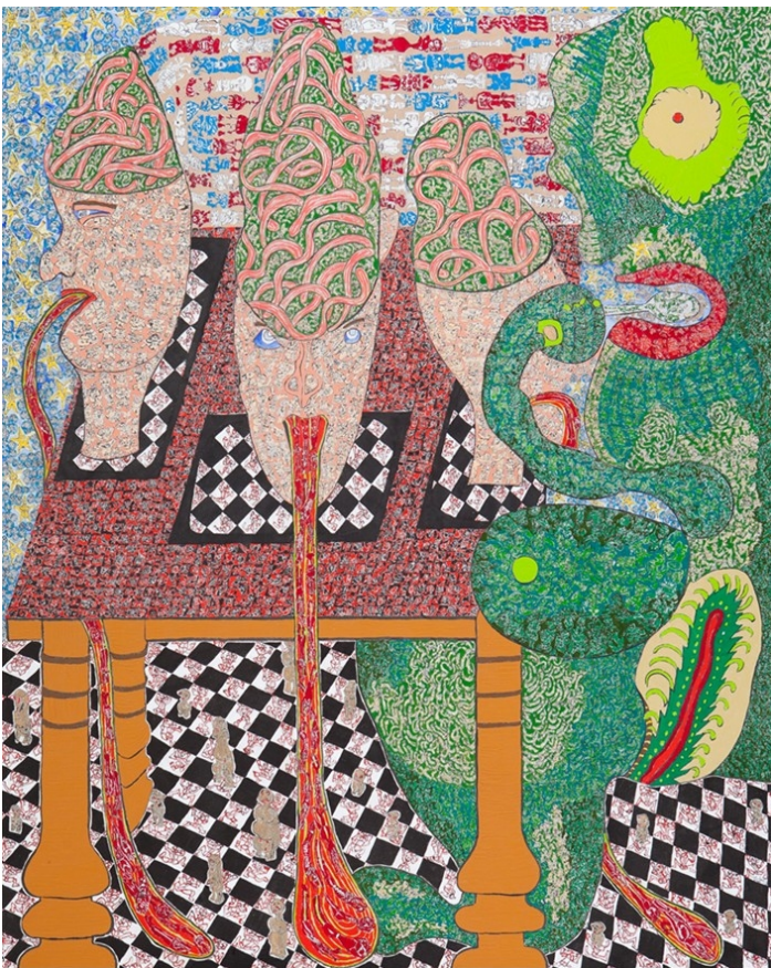
Checkmate Monkey Stew