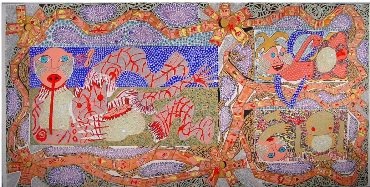
Trilogy of the Dying Babies, 2006, 8'x4'

In addition to working as an artist, Sibio taught people with mental disabilities from 1985-2008, which provided her with a new approach to art she dubbed "The Insanity Principle." The approach involves using symptoms of mental issues as a catalyst for a "primal journey" that in turn enables those with disorders to function in society.