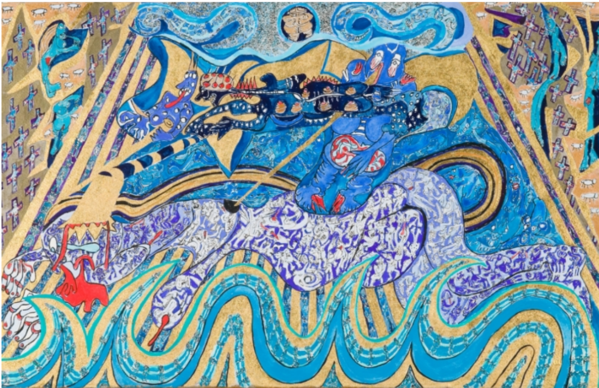
Incident at Sheep's Bay, 2007, 13" x 20"

In the late 19th century, Southern California attracted misfits, idealists, and entrepreneurs with few ties to anyone or anything. Swamis, spiritualists, and other self-proclaimed religious authorities quickly made their way out West to forge new faiths. Independent book publishers, motivational speakers, and metaphysical-minded artists and writers then became part of the Los Angeles landscape. From yogis, to psychics, to witches, City of the Seekers examines how creative freedom enables LA-based artists to make spiritual work as part of their practices.