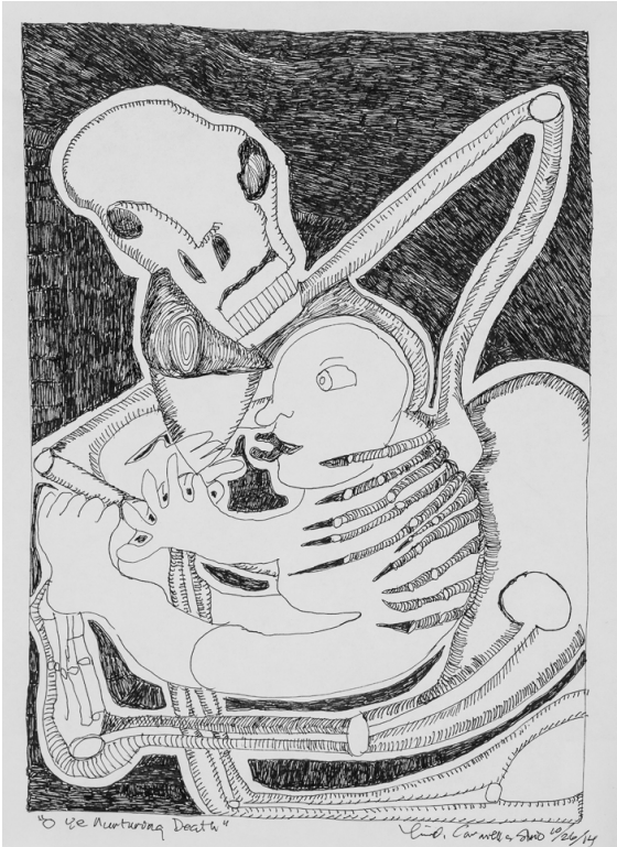
O Ye Nurturing Death, 2015, 9"x11"