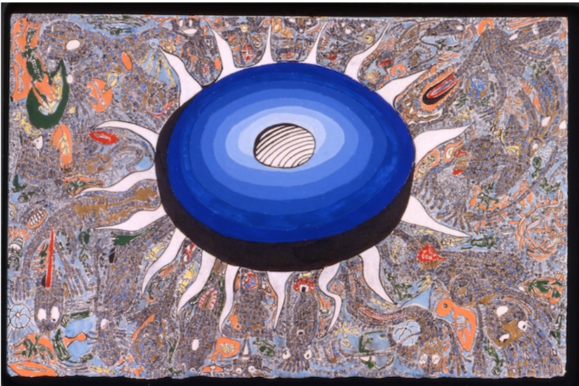
The Seventeen Gates of the Encoded, 2012, Rachel Rosenthal Collection

Right now, Sibio is working on a project called The Economics of Suffering , a series of 500 different small pen-and-ink drawings about finance and hospitalization, which will then be assembled into an immersive sculpture. She's also working on a book, Reflections in a Broken Mirror , and has spearheaded a fashion project called Crazy for a Day . But whatever medium she's using, whether she's exploring form or function, it's Sibio's so-called "madness" that is actually her sanity—a lifeline that allows her to go deep into her own thoughts and make them visible.