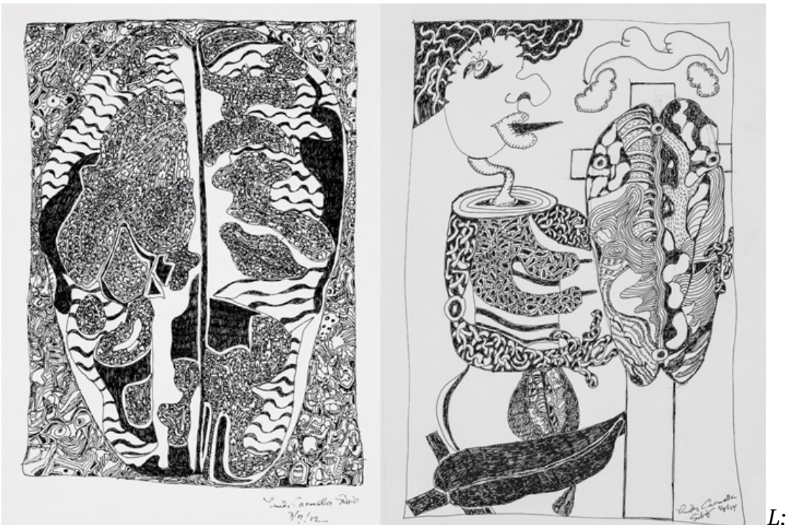
Schizophrenic Brain Trust, 2015 R: Schizophrenic Brain Trust Two, 2015, 9"x11"