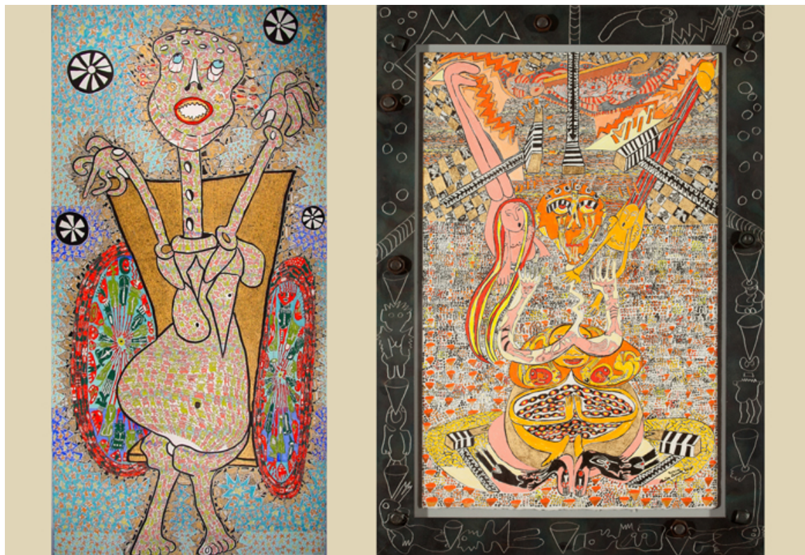
L: Trapped, 2002, 8' x 4' R: Hammer Rhetoric, 2014, 13"x20"

trying new techniques to fulfill the images in my mind. Often while I'm working, suddenly I realize I haven't slept. Life's labors get in my way. I wish I did not have to brush my teeth, brush my hair, shower, etc.—All I want to do is make art."