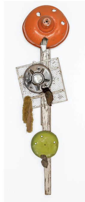
Hawkins Bolden, Untitled , c.1980. Found objects, metal, fabric and enamel, 70 x 20 x 12 inches