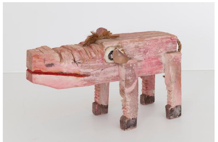
Hans Schmitt, Little Pig , c.1970s. Wood, 18 x 10 x 7 inches