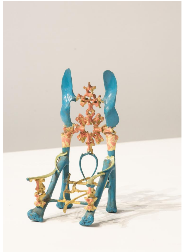
Eugene Von Bruenchenhein, Throne Chair , c. 1960. Chicken bones, paint, airplane glue and varnish, 6 x 4 x 4 inches