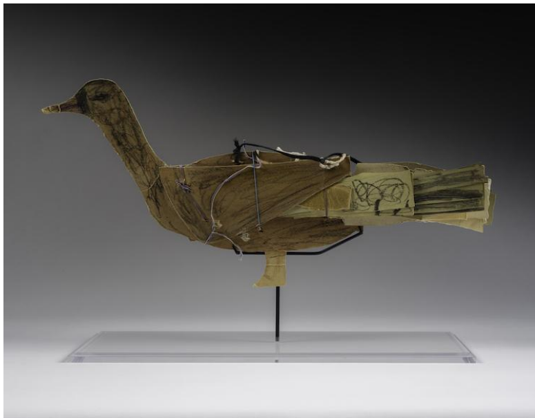
James Castle, Construction (Duck) , mid-20th century. Wax pencil, black crayon, pencil, soot on found papers, with fabric tape and thread, 11 x 19.5 inches