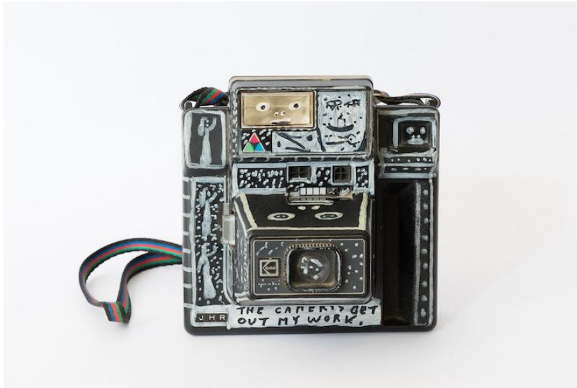
Howard Finster, Untitled , n.d. Paint on camera, 6.25 x 6.25 x 5 inches

fashions a woman giving birth to a child from a piece of rusty steel; and an anonymous artist humorously transforms a funky chunk of driftwood into a rather curious canine.