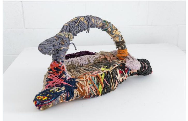
Judith Scott , Untitled, 1992. Wool and cotton string, mixed media and wood, 13 x 25 x 13 inches