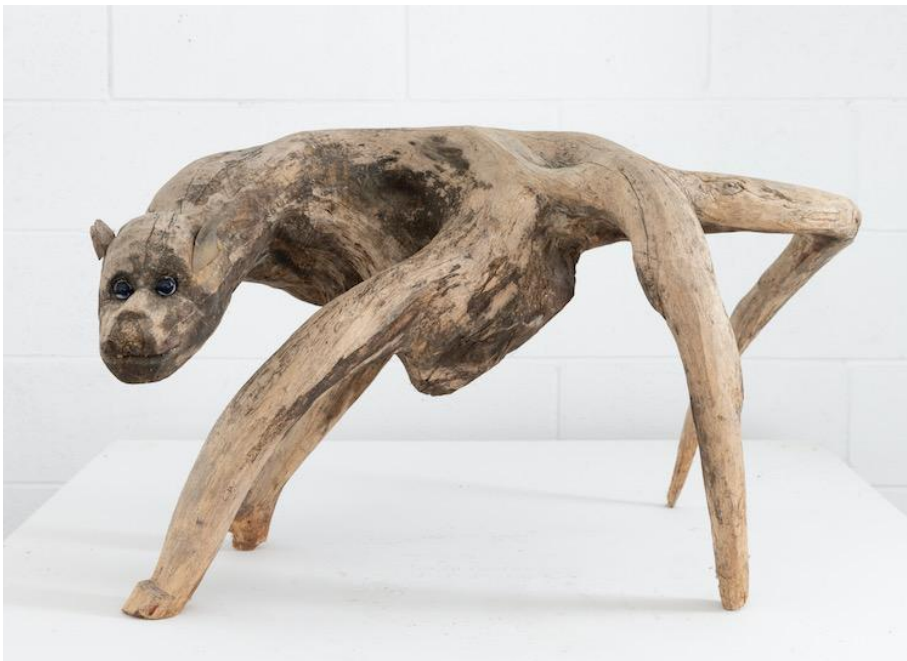
Unknown Artist, Root Carved Dog, Late 20th Century. Wood and marble, 17 x 24 x 27 inches