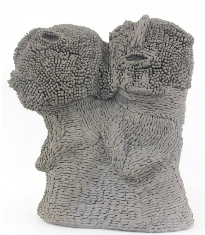
Kazumi Kamae, Masato and I visit the ISE Grand Shrine , 2021. Fired clay, 12 x 11.2 x 7.5 inches