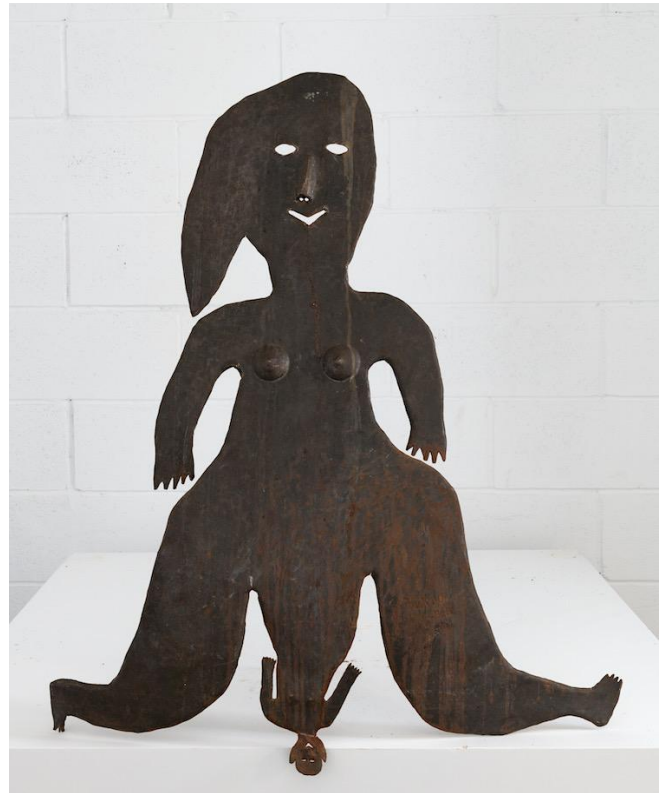
Georges Liautaud, Untitled (Birth), c. 1960. Steel, 36 x 30 inches