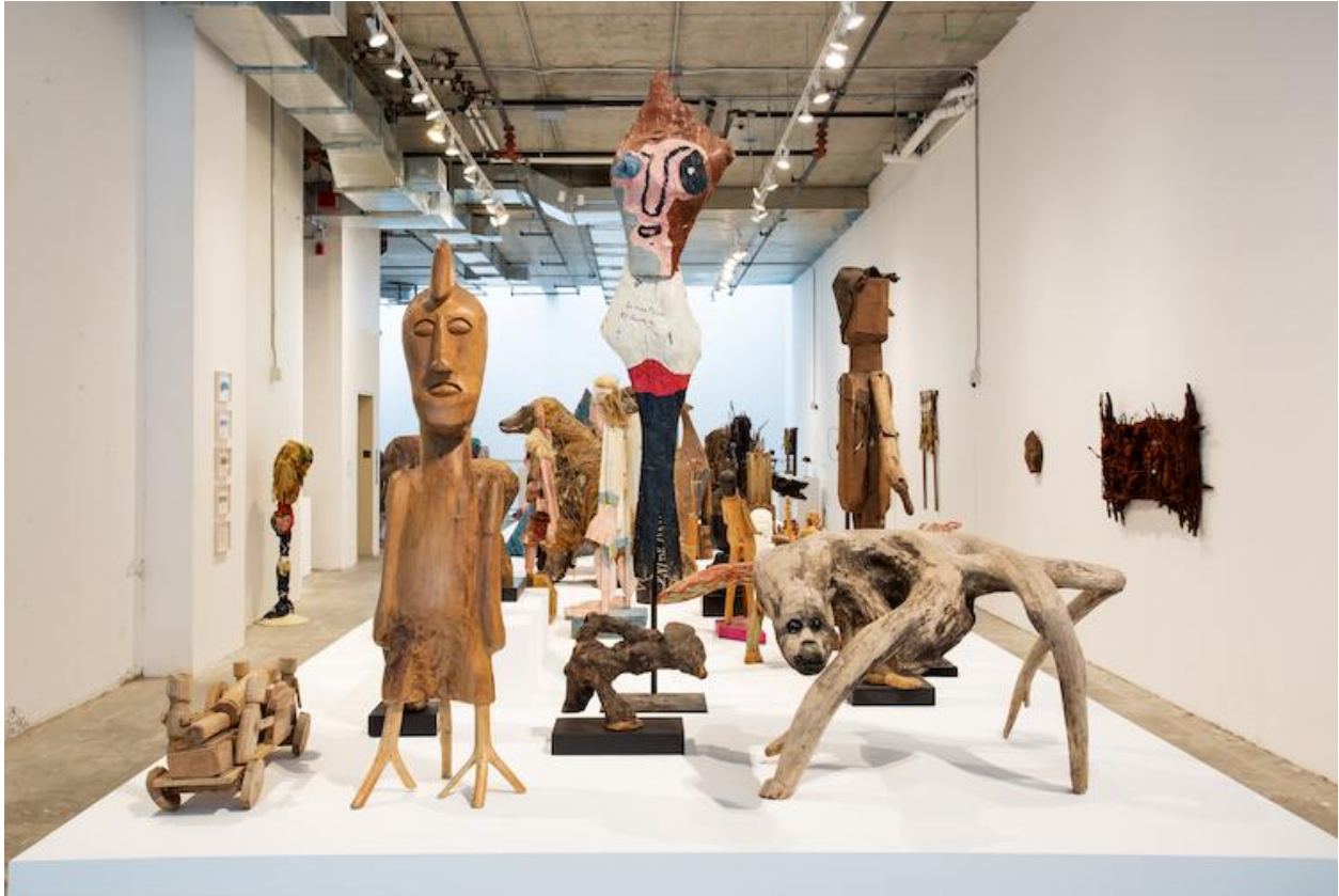
Installation view of "Super-Rough," Organized by the Outsider Art Fair with guest curator Takashi Murakami.

Featuring some 200 sculptural works by 60 self-taught, visionary and vernacular folk artists, the exhibition Super-Rough turns an abandoned SoHo storefront into a treasure chest of awe-inspiring art. With guest curator Takashi Murakami at the helm and art dealers associated with the Outsider Art Fair providing the sculptural booty, this show, which runs through June 27, is a delight for both the mind and the eye.