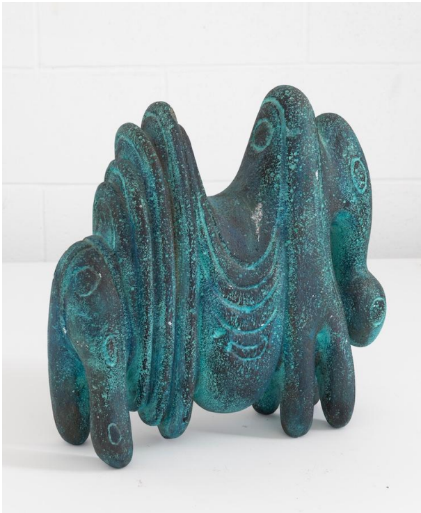
Chomo (Roger Chomeaux), Cheval Plissé , c. 1980. Concrete, paint and plaster, 14 x 7.25 x 2 inches