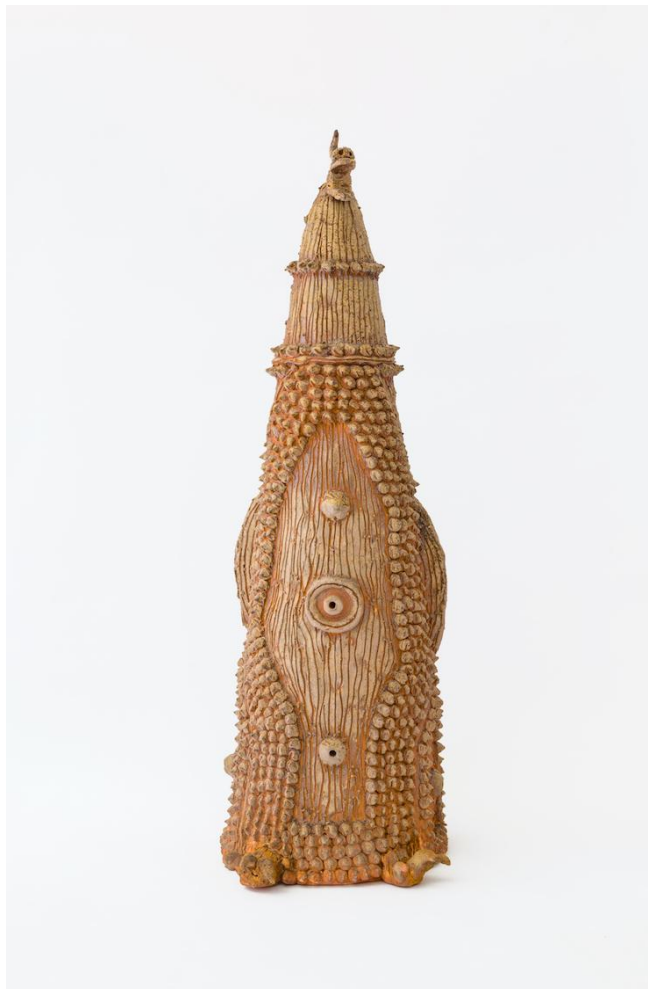
Shinichi Sawada, Untitled (3), n.d. Wood fired clay, 20 x 7 x 6.25 inches