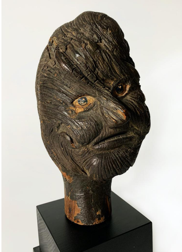
Moses Ogden, Twisted Head , c. 1900. Wood, 9.5 x 4.5 x 6 inches