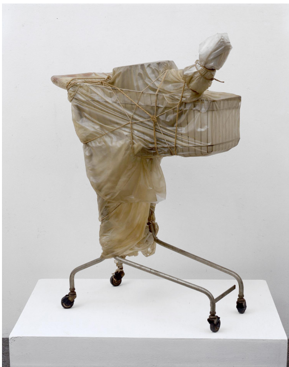
Christo, Packed Supermarket Cart, 1963

Dynamically presented in Grand Palais Éphémère, a temporary exhibition hall designed by architect Jean-Michel Wilmotte near the Eiffel Tower, the 47th edition of FIAC , presenting 170 galleries from 25 countries, opened to a packed house as collectors quickly filled the aisles and gallery booths to make significant purchases. With Covid seemingly under control from strict regulations requiring proof of vaccination to visit cultural institutions,