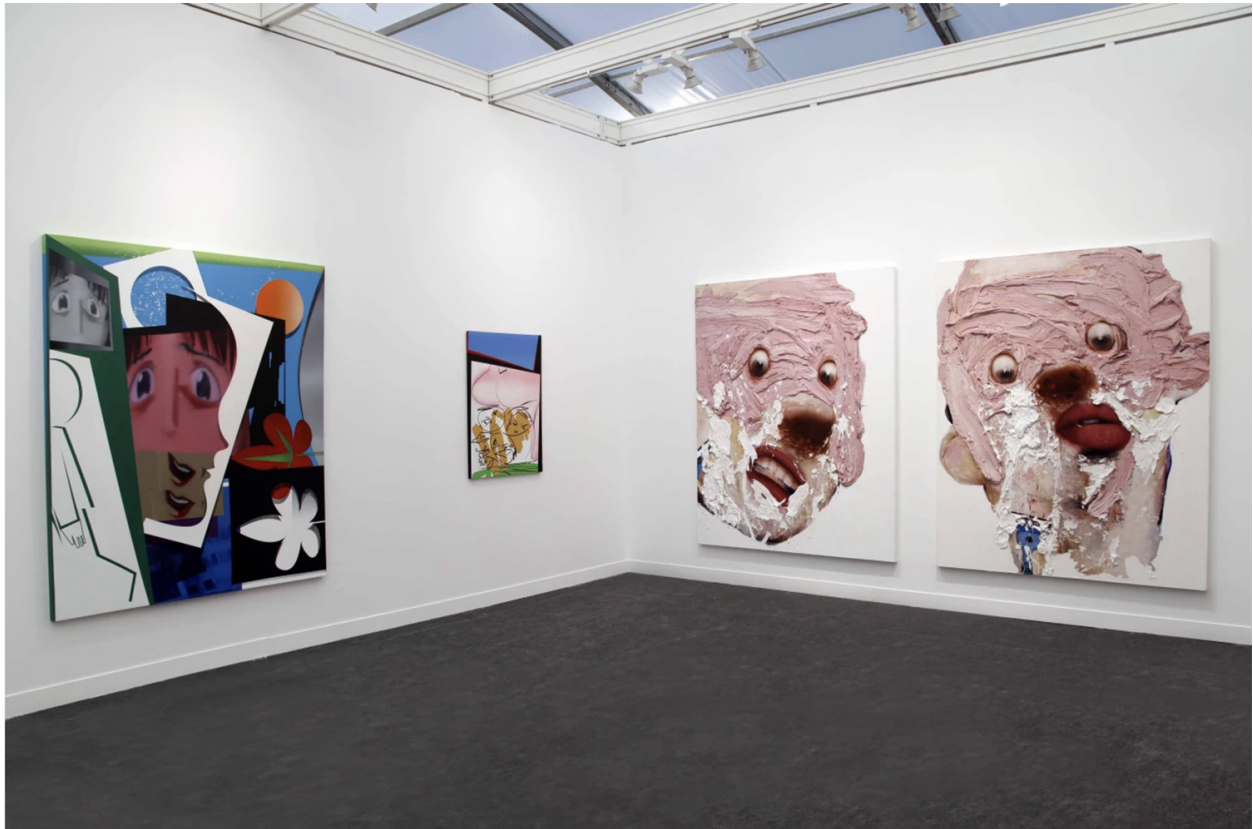
Installation view of Hoda Kashiha and Farrokh Mahdavi at Dastan's Basement's booth at FIAC 2021.

a women's pudendum that was initially shown in an Axel Vervoordt-curated exhibition at the Palazzo Fortuny in Venice and is now on view at the fair, reflects Baudelaire's interest in the pleasures of the flesh, while ironically referencing one of the Musée d'Orsay's most famous works of art, Gustave Courbet's L'Origine du monde .