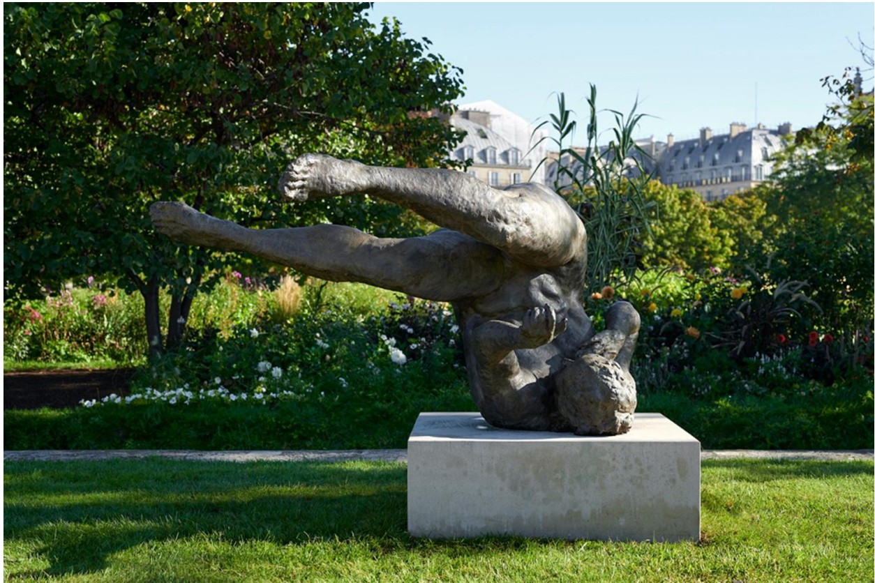
Eric Fischl, Tumbling Woman , 2002.