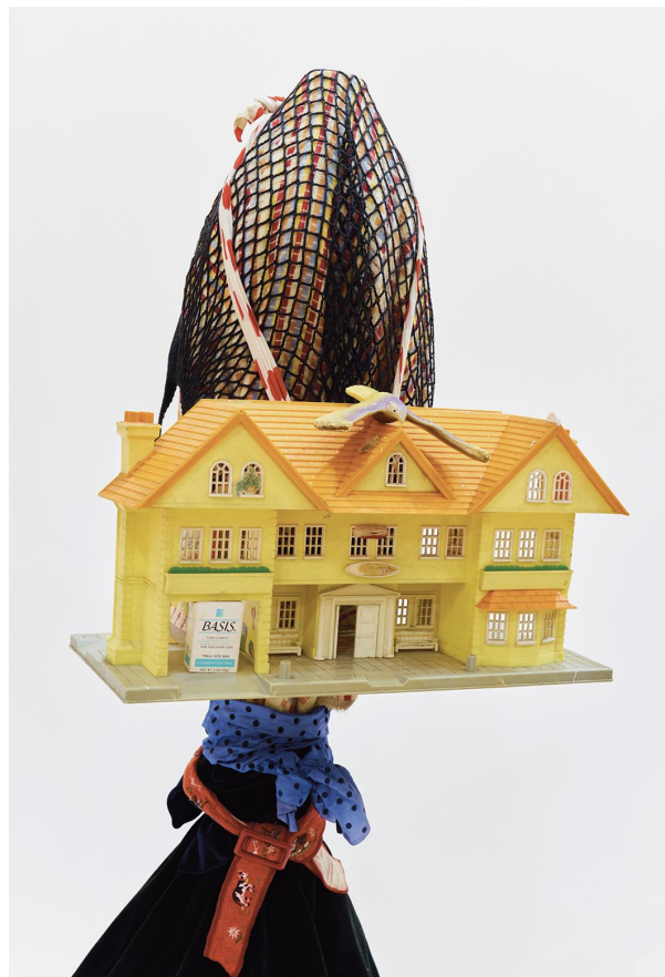
Curtis Cuffie, Every House Deserves a Happy Home, Every Home Deserves a Happy Family (detail), 1996, dollhouse, fabrics, basketry, metal frame, 60 × 23 × 23".