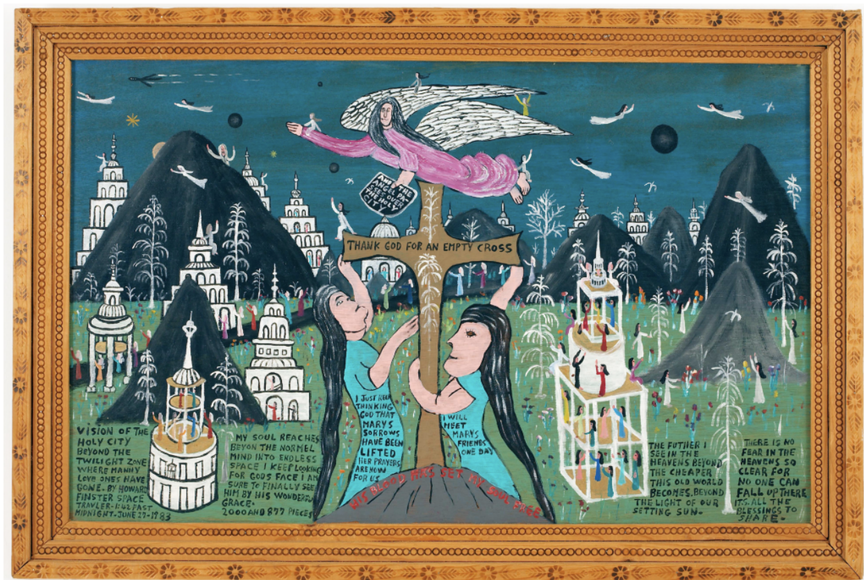
Howard Finster THANK GOD FOR AN EMPTY CROSS (2000 AND 877 PIECES) , 1983, Paint on wood panel.

If you can believe it, the Outsider Art Fair, which opened its latest edition in New York at the Metropolitan pavilion this week (through March 6), is 30 years old this year, and it's natural, at such a milestone, to consider how things have changed over the years.