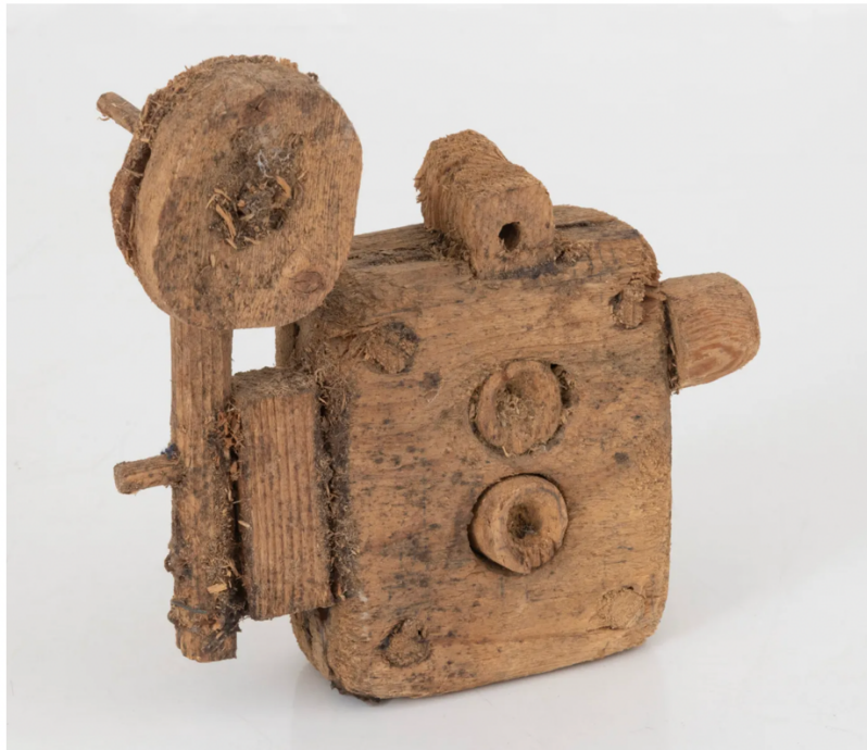
John Byam (1929 – 2013) Untitled (camera) , n.d. Wood, glue and sawdust 7 x 7 x 2.5 in.